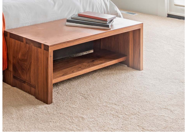
Typical application under approved carpet floor coverings