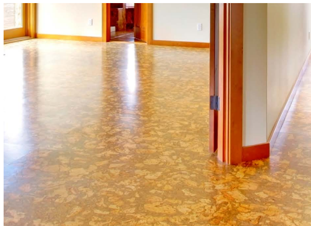
Typical application under cork floor covering