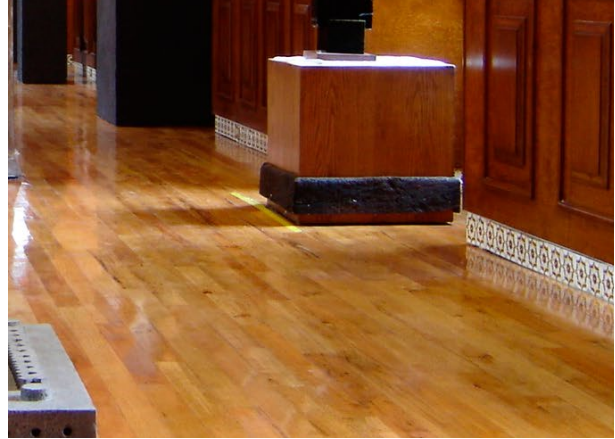
Typical application under T&G or overlay timber flooring