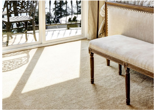
Typical application under carpet flooring