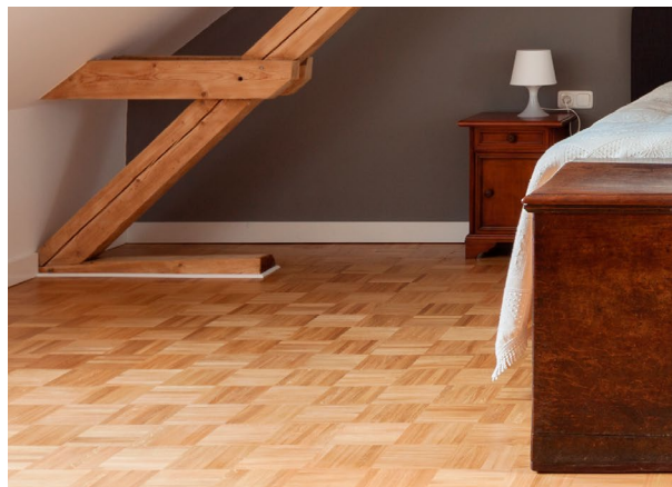
Typical application under parquetty timber flooring