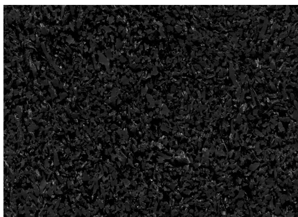
Regupol® 6010 10mm impact sound acoustic underlay