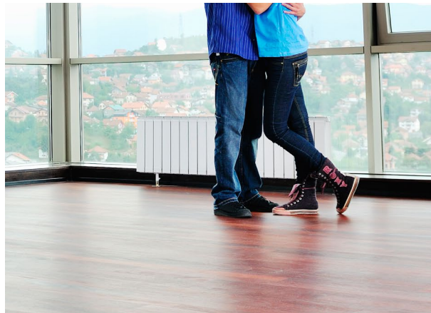
Typical application under T&G or overlay timber flooring