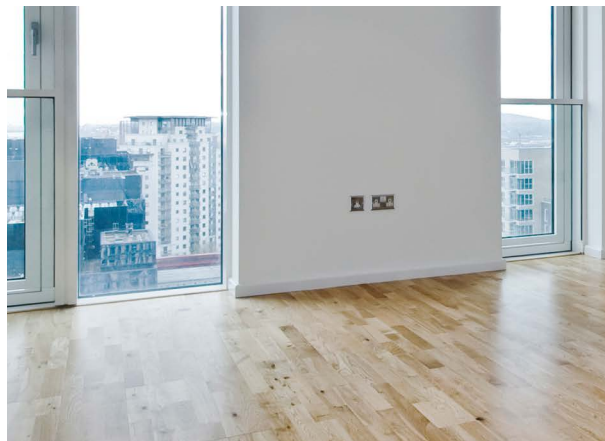
Typical application under T&G and overlay flooring with plywood