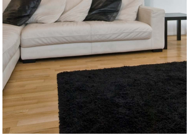
Typical application under rugs