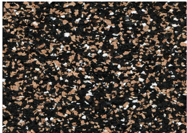
Regupol® 4515 9mm impact sound acoustic underlay