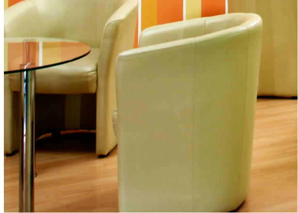
Typical application under T&G and overlay timber flooring with plywood