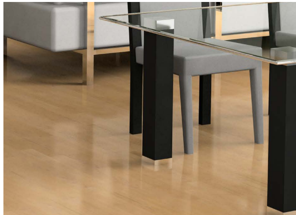
Typical application under bamboo flooring with plywood