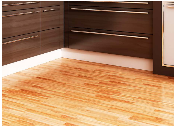
Typical application under engineered timber with plywood