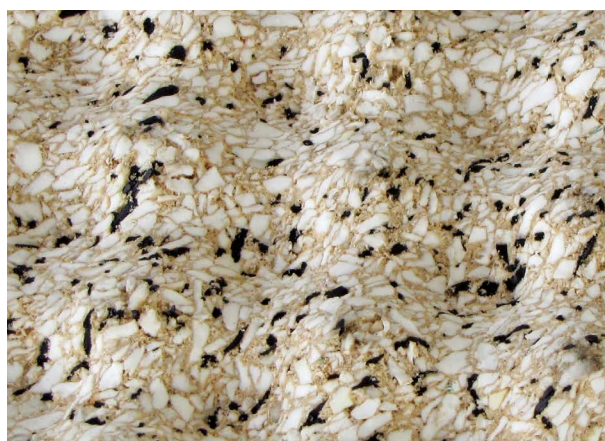
Regupol® V200 17/8mm dimple impact sound acoustic underlay