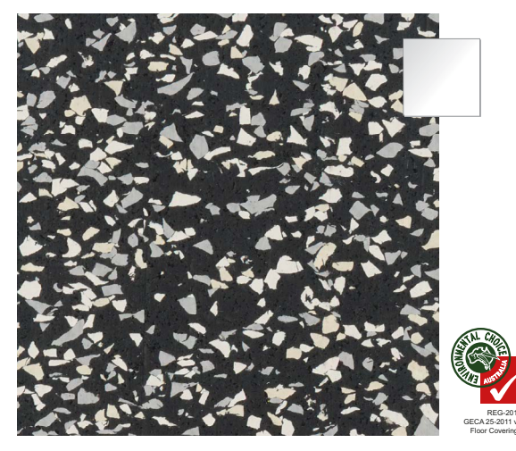
everroll® Vitality Berlin - Tiles (600mm x 600mm)