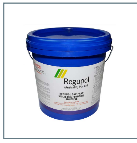
Regupol One Part Multi-Use Flooring Adhesive