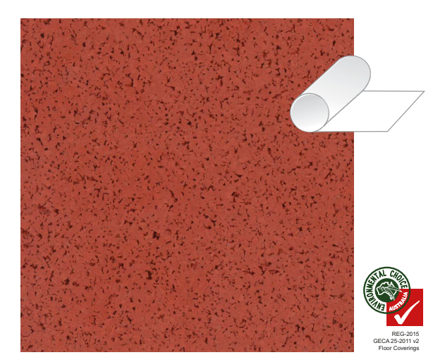
everroll® Shape Goa - Rolls