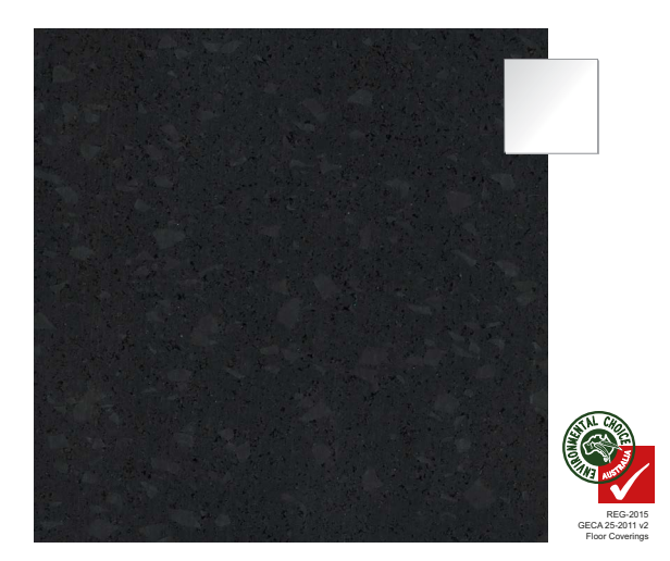
everroll® Core Mons - Tiles