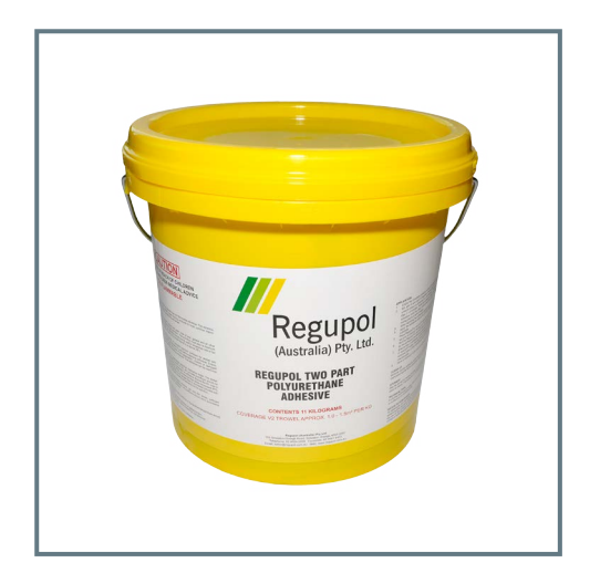
Regupol Two Part Polyurethane Adhesive